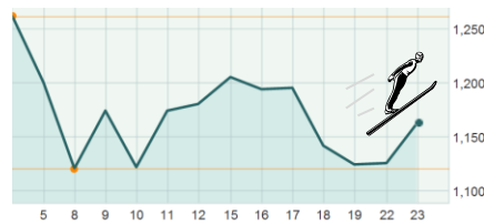
S&P 500, August 4-August 23, 2011

Recent days, weeks, months and even the past several years have left many equity investors feeling more than a little seasick. The credit crisis and vicious bear market of 2008 caused investors to question whether they can trust the financial system. Many seasoned investors have fled to the relative safety of cash and bonds, and younger people are still questioning whether it is worth allocating capital to the global stock markets at all.